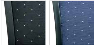
Black Fabric-Black Frame Blue Fabric-Black Frame