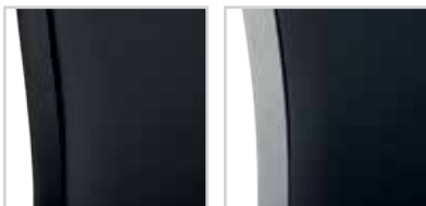
Black Vinyl-Black Frame Black Vinyl-Silver Frame